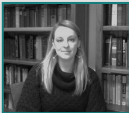
Owner, Juniper Shore Publications LLC