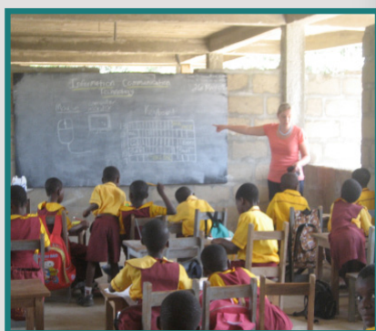
Volunteer Teacher, Cape Coast Ghana